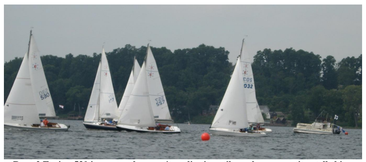
Race 2 Ensign 530 is over early - won't realize it until another competitor tells him.