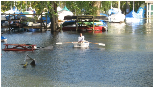
A little rowing practice before the regatta!