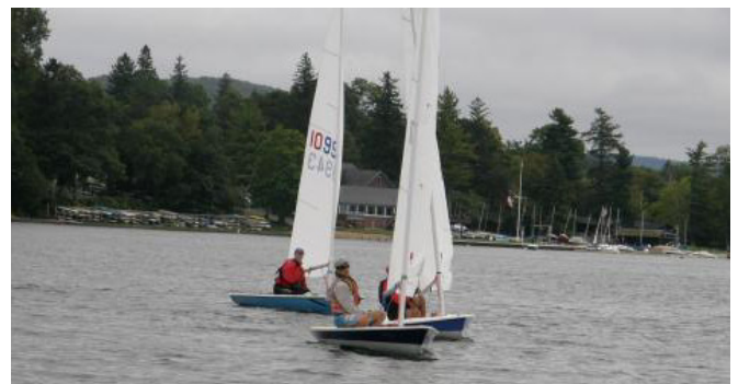
This more like it