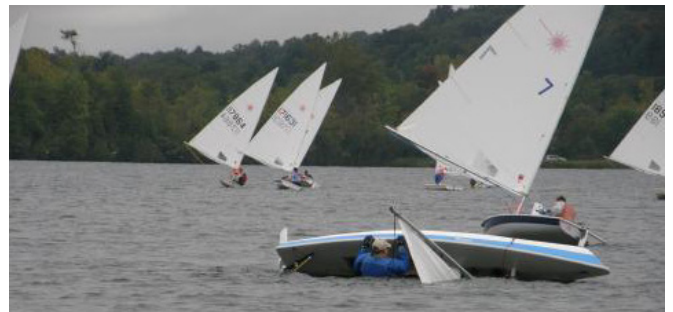
I'm behind; can't stop to help!