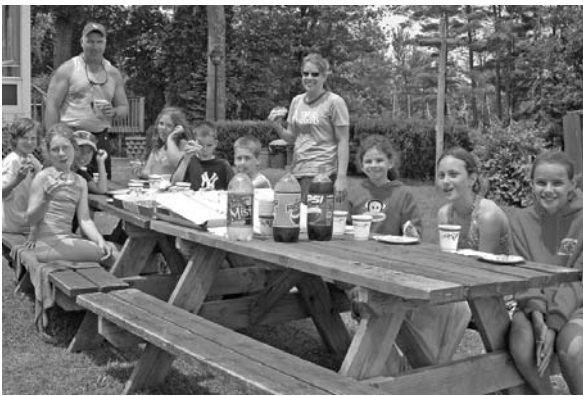
Junior Sailing Class