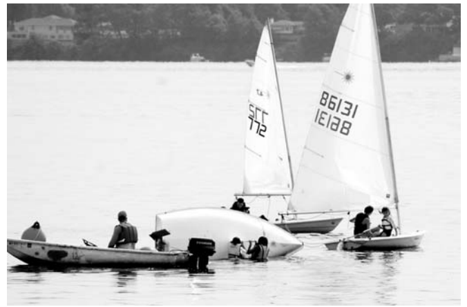
Juniors practicing righting