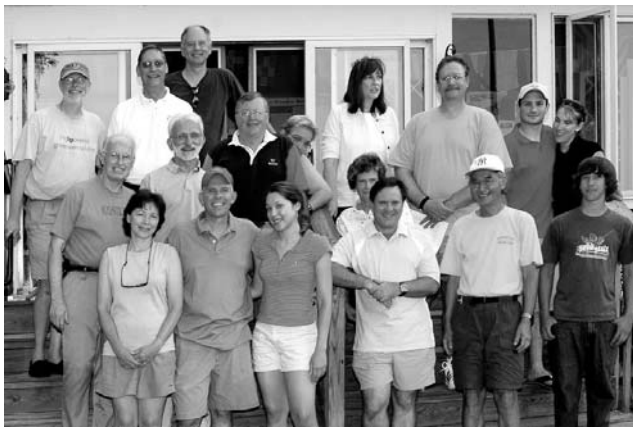
The Kestrel Fleet