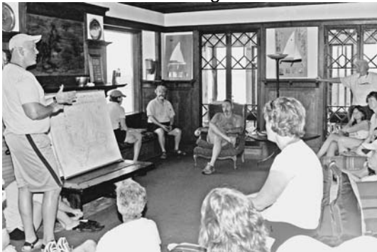
Adult Sailing Class