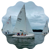
Adult students in Flying Coats