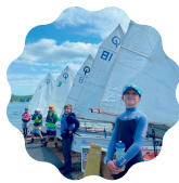
Optimist Team at AYIC

4 1st place Awards at Travel Regattas • 1 x 3rd place • 2 x 4th place