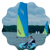
Campers in Fusions & Optis

$2,650 youth scholarships granted by PSEF to campers & race team