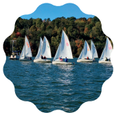
420 Sailors at Osprey Cup