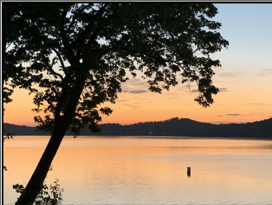
A beautiful sunrise picture taken by member Laura Dillon