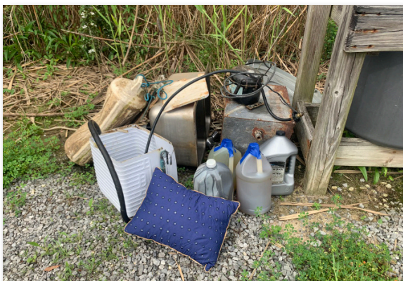
Unauthorized trash thrown away in the Harbor