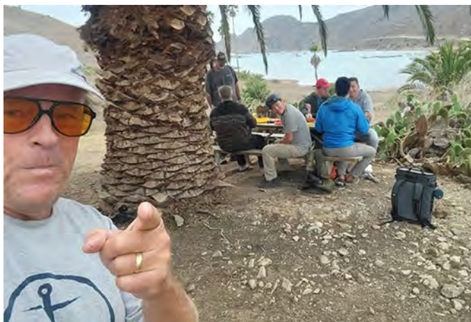
Yon organizes a well deserved break during the stag cruise decathlon

The following photos have been declassified: