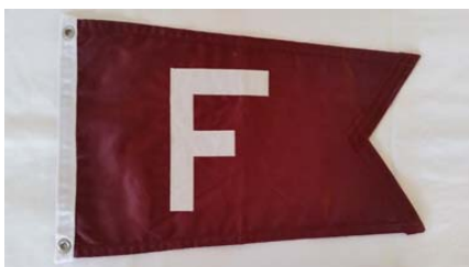
Mystery Burgee 1