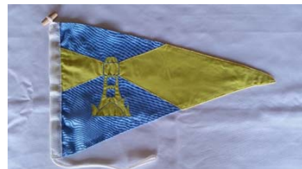
Mystery Burgee 2