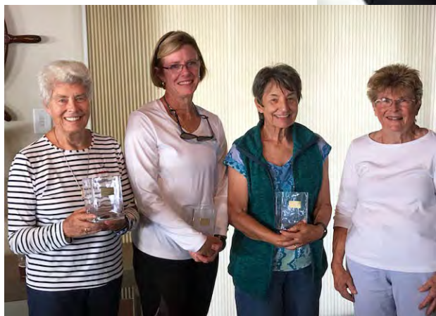
Ladies A Fleet