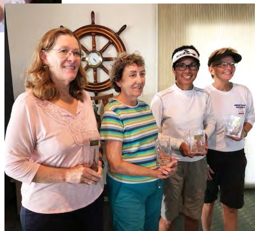
Ladies B Fleet