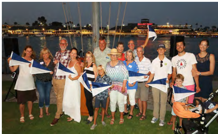
Gold Fleet Cal 20's bang the infamous Long Beach right side shortly after the start with the down town skyline in the background.

Cal 20's have adopted a volunteer system where sailors can sign up for different fleets based on their experience and desired level of sailing including Gold, Silver, and Bronze fleets. Gold fleet had 24 entries and the ever growing Bronze fleet boasted 11 entries. Only two boats signed up for Silver and they joined the action in the Gold fleet. All ABYC entries raced in Gold fleet. We would love to get more intermediate ABYC Cal 20 sailors out in Silver fleet. Even though the racing was top notch and competitive, sailors enjoyed each other's company on shore with several fun social events hosted by Shoreline YC. Friday evening included a burger bash and complimentary keg, Saturday evening's festivities included a lovely teriyaki dinner, and Sunday included a happy hour along with the awards ceremony. All Cal 20's were guest moored in Shoreline marina and this regatta hence had a bit of road trip vibe.