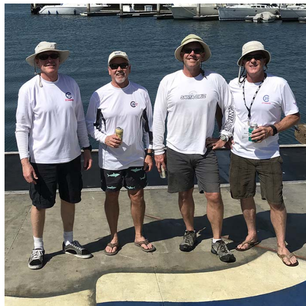
The ramp crew