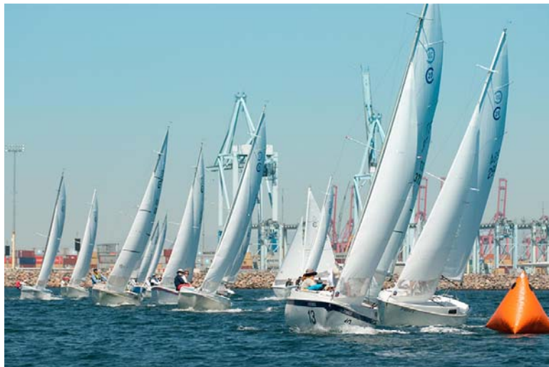
Racing action at last year's Class Championships at CBYC. Make sure to join the action this year at Shoreline YC of Long Beach.