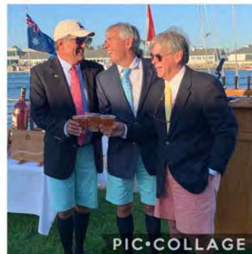
Who wore it best? (Thanks Stacey Shack for the collage)