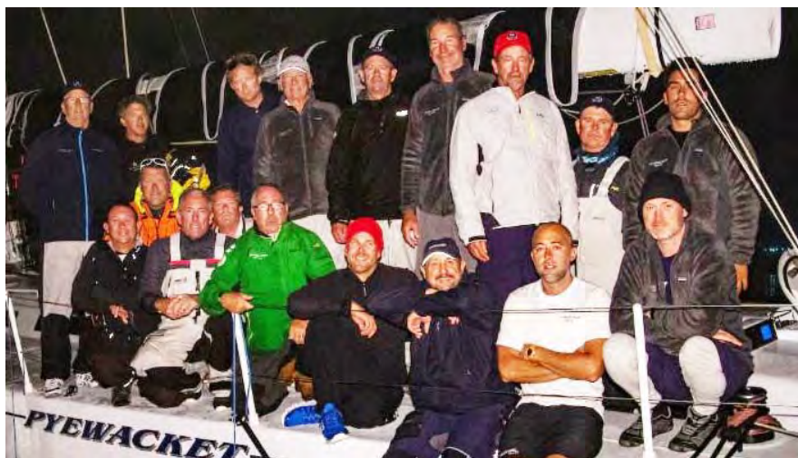
Crew members of the OEX and Pyewacket after their safe arrival back on land.

"We came across the eerie sight of a mainsail up on a boat that was going under the waves," said Disney. "It's a pretty tragic thing to see, and these two lifeboats tied together with flashing lights on them."