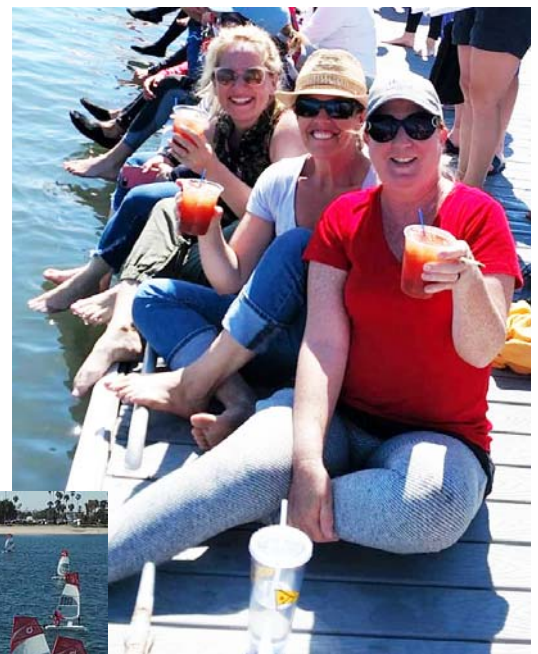
ABYC Mommy Mafia 2019