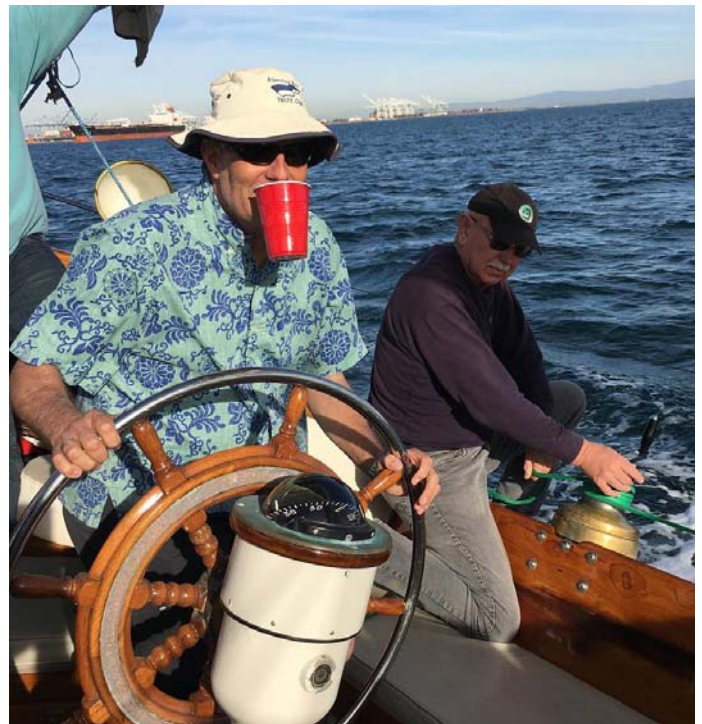
Best Commodore Photo Ever!!