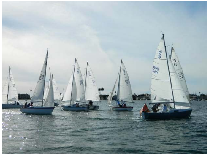
Racing at the LBYC Fun Run