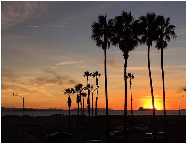
Stacey Schack 12-29