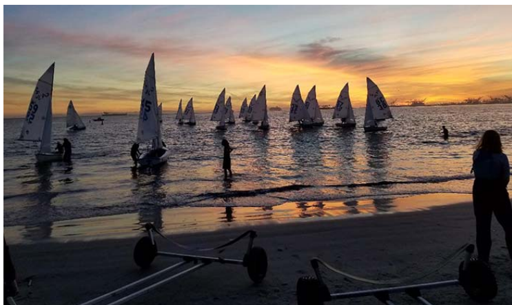
Cool sunset shots