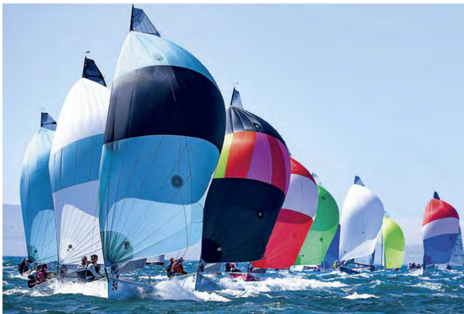
Perfect windy day in Long Beach, California made it the optimal venue for the 15th Los Angeles Olympics and a historic occasion when the Games return to the City of Angels in 2028. At the Viper 640 World Championships, competitors take advantage of these trademark conditions, maximizing their powerful sail plan to get up on a plane in a snap.