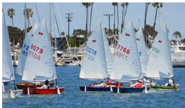
Masters Gold Fleet charges off the start line working the left side towards the Marina office on Sunday.