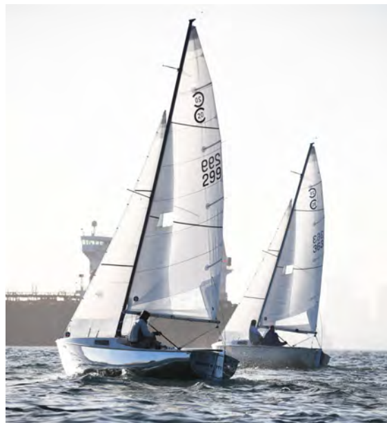
The Corzine boat with a new chrome paint job