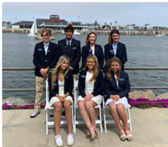
The ABYC Junior Board had a wonderful afternoon assisting in the Opening Day festivities