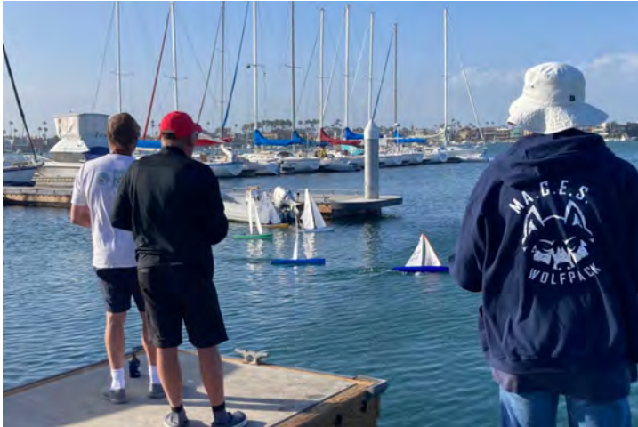
There are several members sailing in the basin or at LBYC on a Friday evening. Here is a picture of the Racin in the Basin.