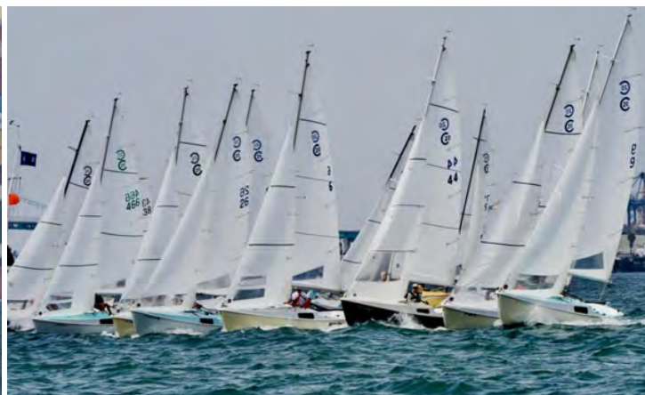
Starting line action with 29 Cal 20's fighting for a clear lane to weather