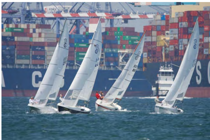
Cal 20's beating to weather with a COSTCO container ship in the background in the LA Harbor shipping lane (that we stayed out of btw)