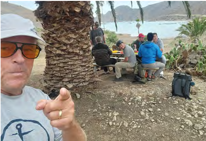
Yon organizes a well deserved break during the stag cruise decathlon

The following photos have been declassified: