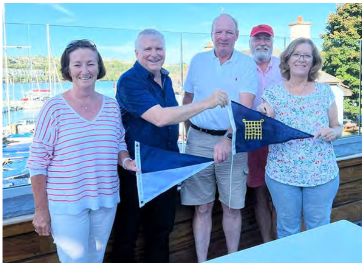
Kinsale Yacht Club