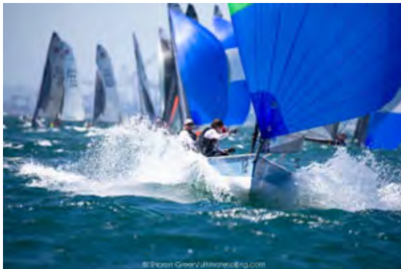
18 knots, 2019 Worlds hosted by ABYC, (photo credit to Sharon Green, Ultimate Sailing)