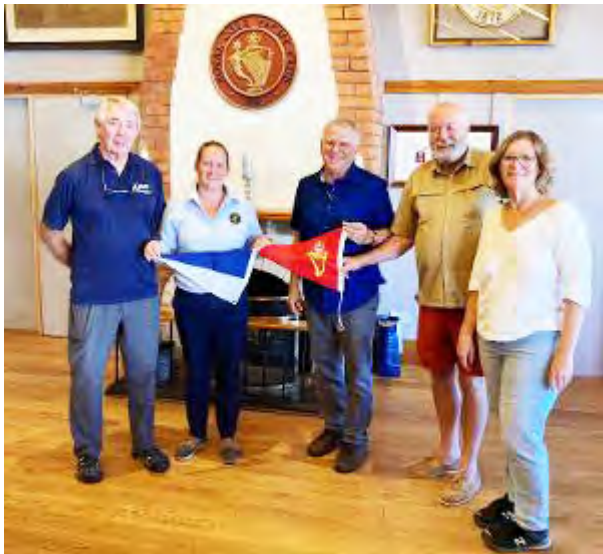
Royal Cork Yacht Club