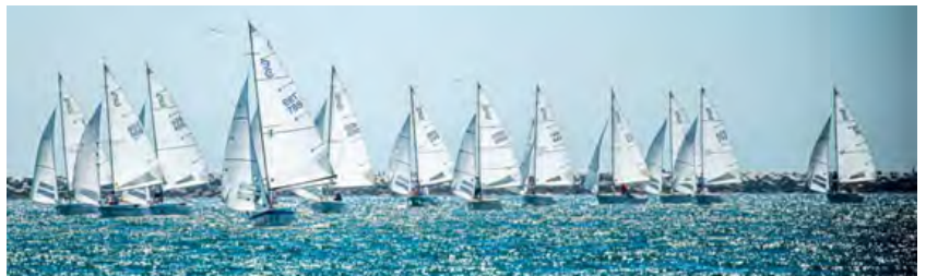
Racing wing and wing downwind in Long Beach Harbor