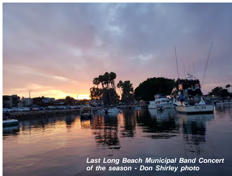
Last Long Beach Municipal Band Concert of the season