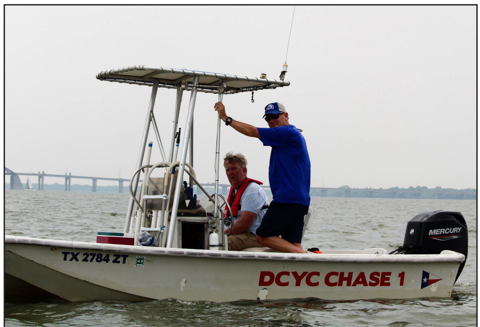
"LAND WAS CREATED TO PROVIDE A PLACE FOR BOATS TO VISIT." - BROOKS ATKINSON