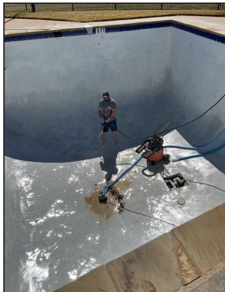
Figure 5 Final cleanup beginning

In preparation of the installation, electrical work was