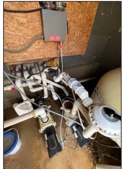
Figure 6 Last day of equipment removal

The new equipment provides for better flow rate, better filtering, and the potential to reduce electric usage. It has taken some time to get all the issues identified and corrected, but the results are worth it.