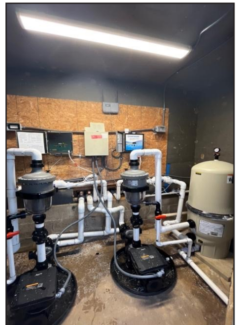
Figure 7 New equipment installed, and in operation!