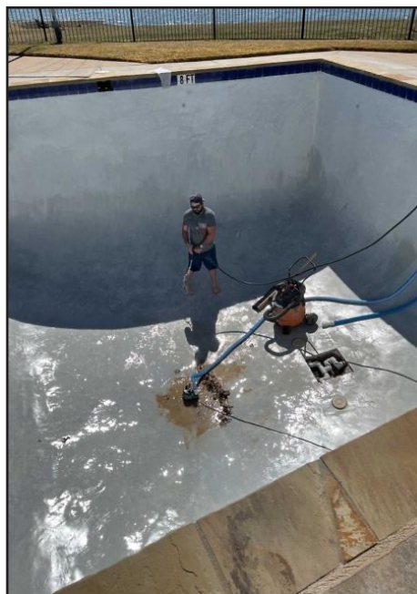
Figure 1 Main Drain Repair drain repair, which required draining the pool and restarting it.

There were three leaks identified and repaired. The most extensive was the main