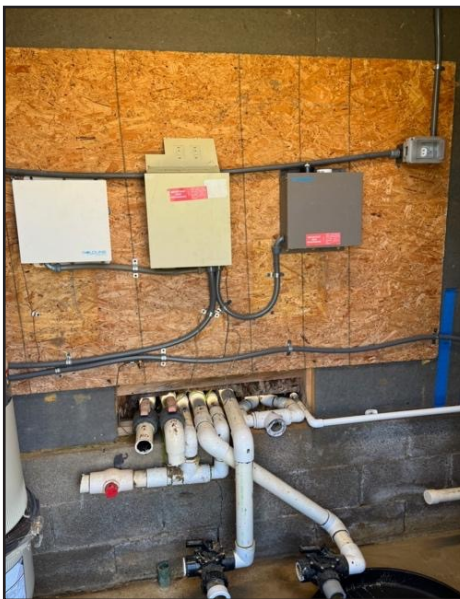
Figure 4 Piping almost ready for removal

Since the equipment shed was already empty, the equipment installation was completed in one day. The new system consists of variable speed pumps, sand pre-filters and cartridge filters. Since