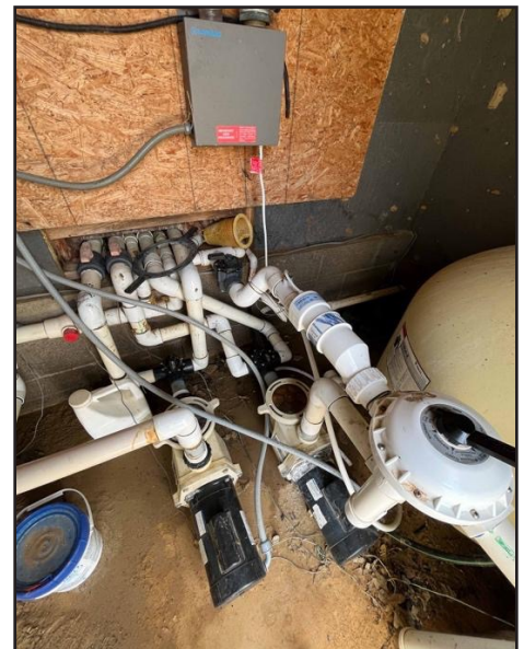
Figure 2 Old Equipment

After the leaks were repaired, the pool was filled and the restart process started. The pump of one of the two systems failed and was not easily