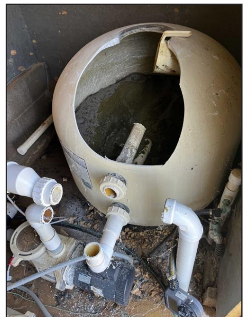
Figure 3 Removing old sand filter

replaceable. It was suspected that was filter that was responsible for sending sand into the pool. The BOG decided that based upon the age, and