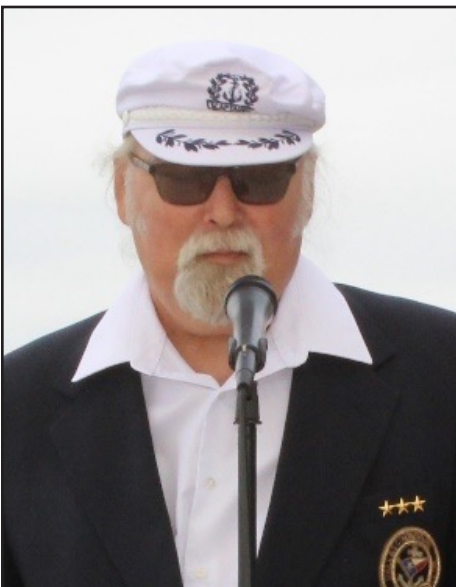
From the Commodore