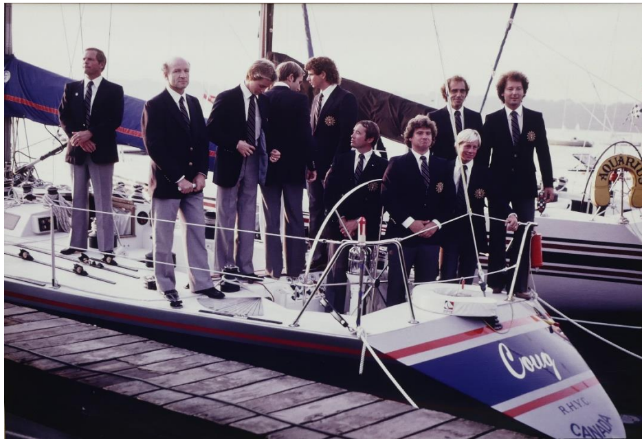
The 1981 Crew of Coug I