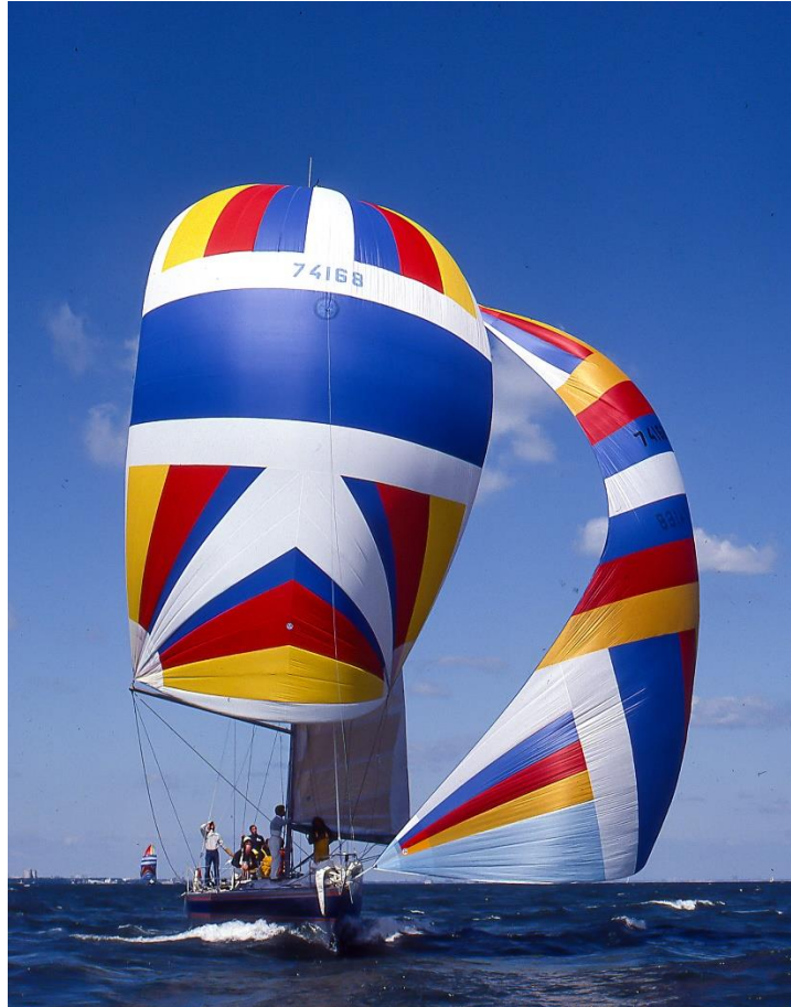
Coug I in the 1981 racing against Black Magic

The rules called for the boats to weigh not less than 15,000 lbs, so we lifted the boat on a crane on the old fuel dock with a scale from Stelco. They did not have high tech cranes then. Tony had the right personality and approach to pull this all together. I recall Tony mentioning that he wanted to take a good mix of amateurs and pros and make them gel as a team. Tony would try to break the combative aura that was so prevalent in the previous events and break down some old stereotypes of strict camps to create a great atmosphere.