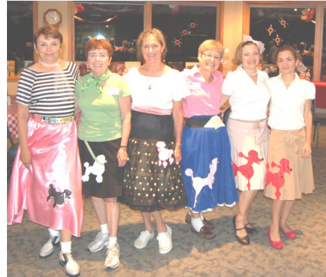
Lots of poodle skirts at the Bop