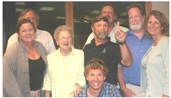
Is there a winner in this group???