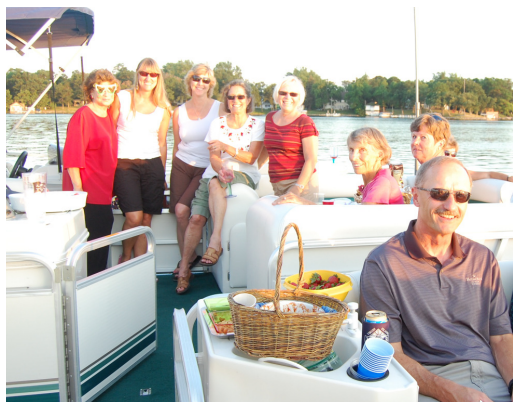
Cocktails and appetizers while floating!