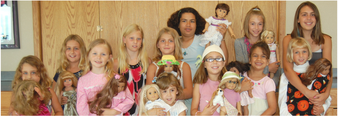
The young gals with their American Girl dolls at the Generations Luncheon on Friday, July 22nd. Some girls modeled.