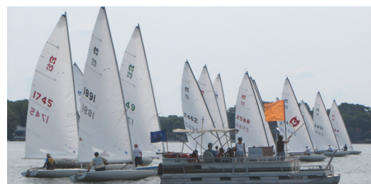
Photo right: The flag going down at the start of the MC race on 7-20.

MC Fleet Party, August 16th 5:30 at Kubicek's Mc'ers, Spouses, & Signal Boat Crews all invited