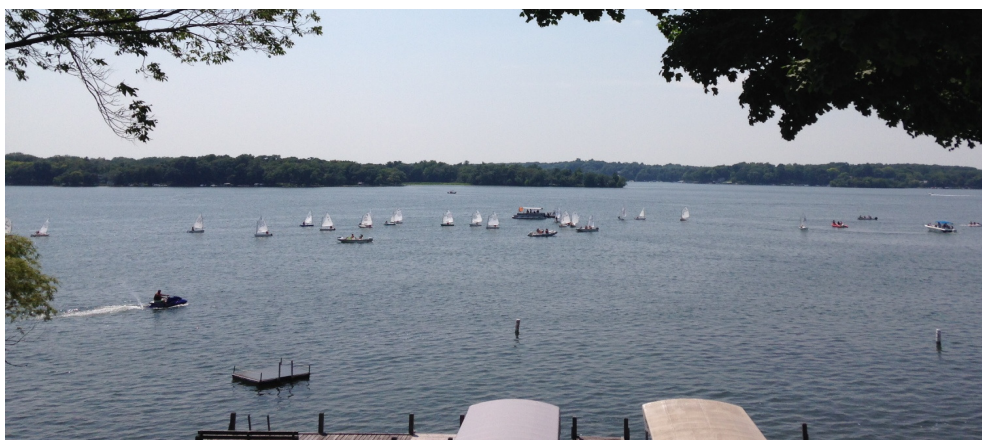
View of the Opti fleet at the No Tears Regatta. Photo by Nahrwold's, from their deck on the east shore. There were 2 fleets, 58 total boats.