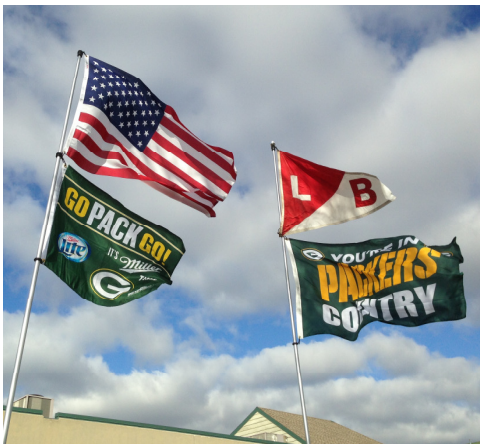
The LBYC flag flew over Lambeau Field this fall.