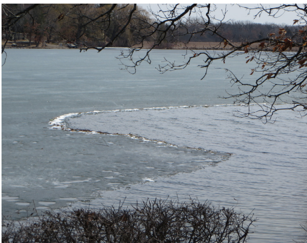
The melt began before April 5th when fast moving water and wind blew down the channel and opened it along with this finger of clear water in the big lake.. It was 6 days later that all the ice melted.