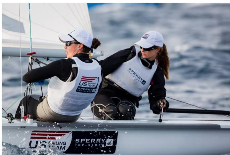
Palma de Mallorca, Spain, April 2013. 850 sailors from 50 countries compete at the ISAF Sailing World Cup event.