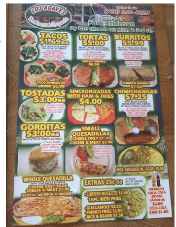
Sample Food Truck Menu