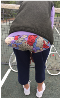
Who is this? Answer next issue

Editor's Note: Tears came to my eyes when I went out to watch the X's sail during the WYA. It brought back the memories of our boys sailing and the good people we met and the fun of it all. The kids, their parents, the race officials, the kitchen moms were all working hard and doing their best, without pay, for the love of their kids and the sport. We really have something good going on here at Lake Beulah, don't we?.