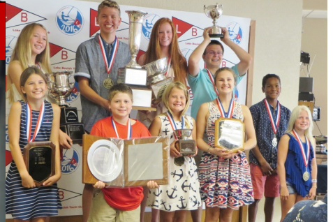
Above: Our X Fleet with all their hardware. Congratulations