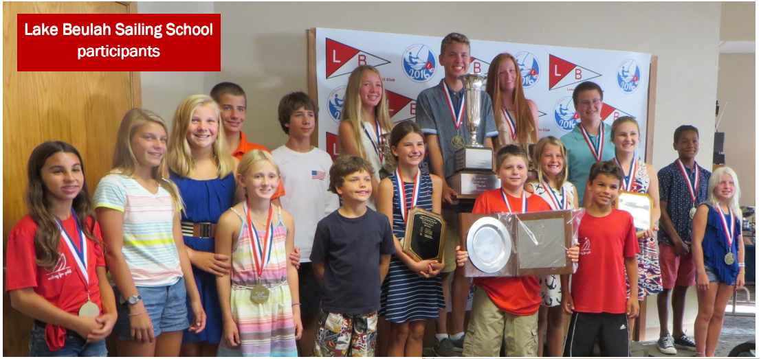
Lake Beulah Sailing School participants