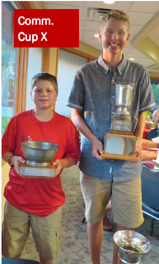
Comm. Cup X