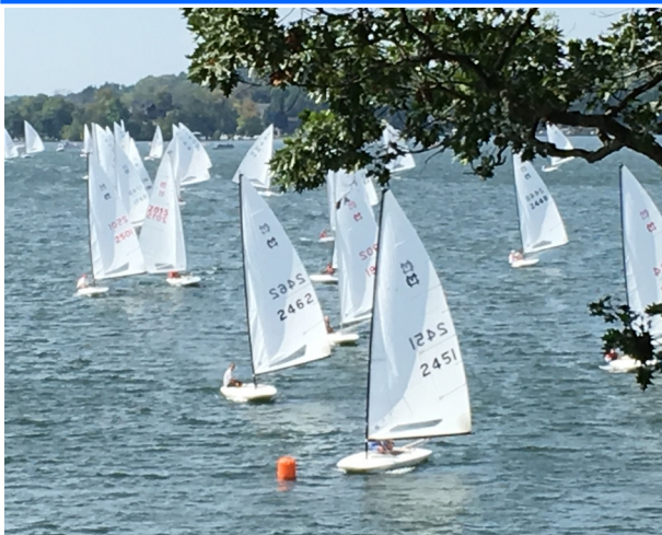
Above: Joe Katcha captures our lovely summer. Taken 9-5

Lake Beulah Yacht Club P.O. Box 833 N9220 East Shore Drive East Troy, WI 53120