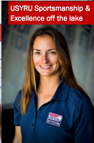
Above: Annie Haeger, Olympian, Rolex Yachtswomen of 2015 and model sportswomen