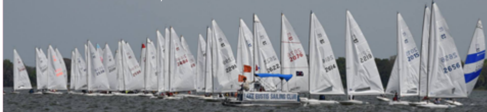
Mid-Winters Lake Eustis, FL