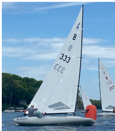
Observed by an editor on the water this past weekend.