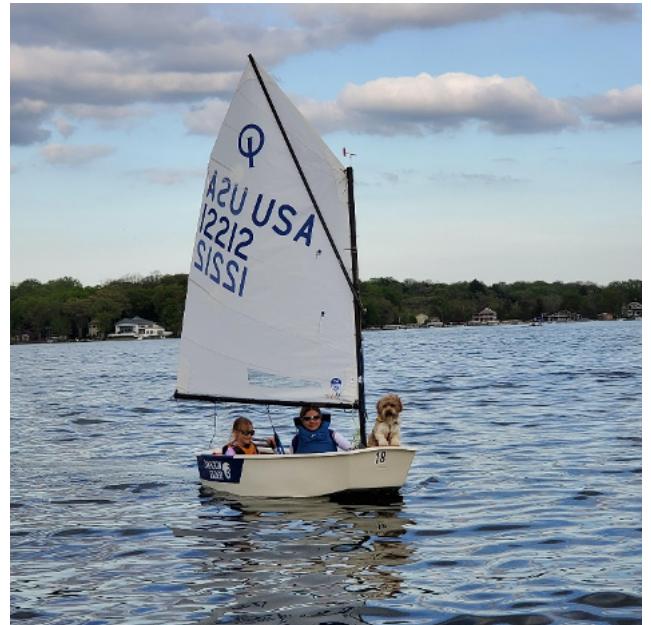
The Greeson girls and skipper out for a sail