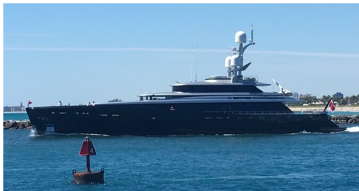
Here is Woody Bach is featured on the bow of M/Y "Kiss" heading out to Palm Beach, FL. Next stop Spain. Kiss is a 152' FEADSHIP with a crew of 11.

Get featured in the Mainsheet CELEBRATIONS section coming next issue.