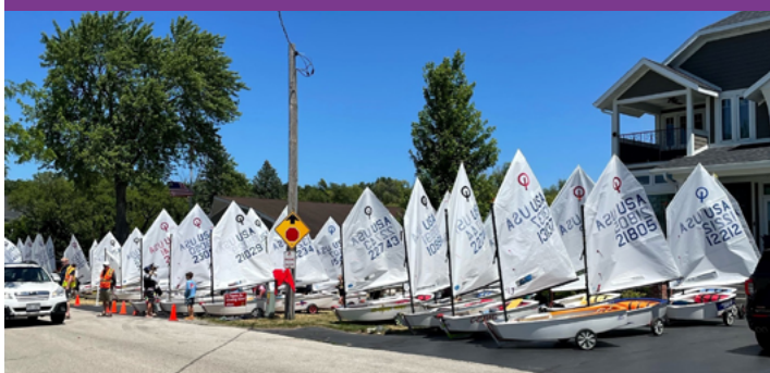
Opti's lined up for the LBSS Opti Regatta filled the LBYC lawn and the Greensons' too. See more pics on the website.