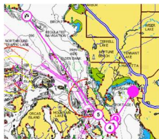
Short Course – Map